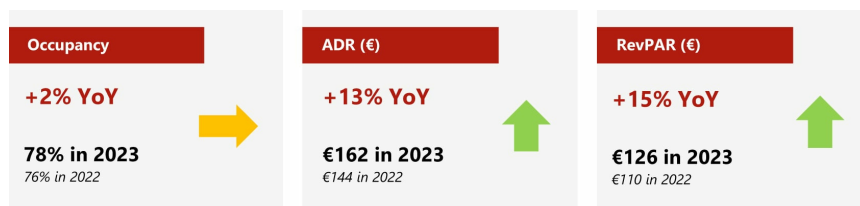
Chart 1: 2023 Serviced Apartment Performance Led by Average Rates

The following chart presents an overview of the recent average rate and RevPAR performance in Europe, as provided by the main Serviced Apartment operators in the market.